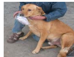
Left: AFI's mascot. Bottom: A scooter AFI painted for an employee.